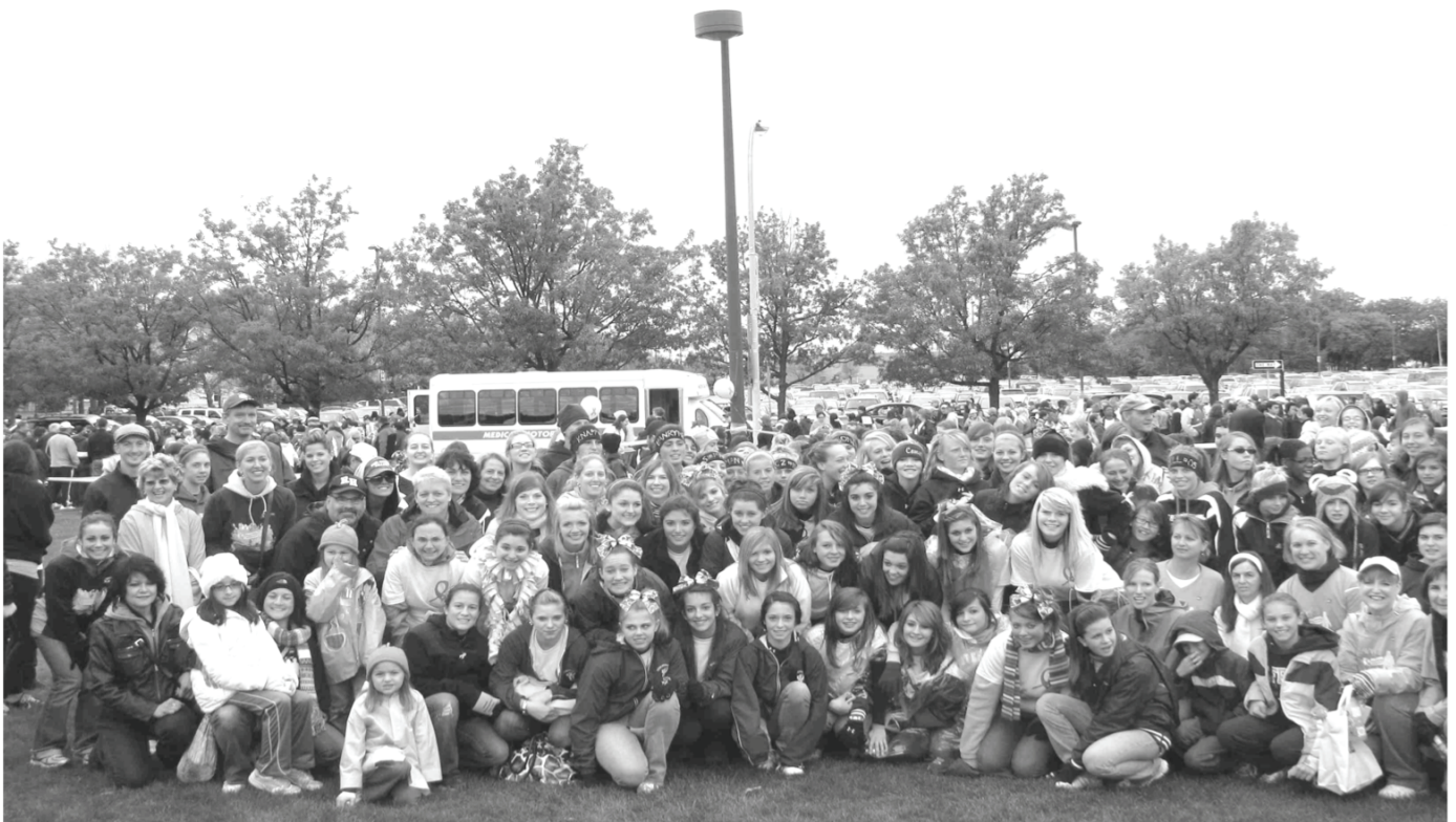
2010 Henrietta Relay For Life